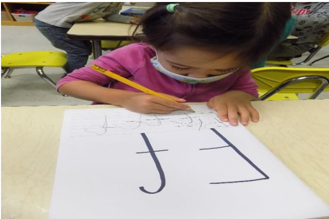
Shooting Stars (PS4) Writing Letters