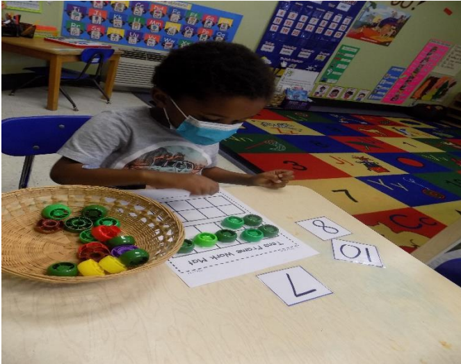
Shooting Stars (PS4) Tens Frame Math