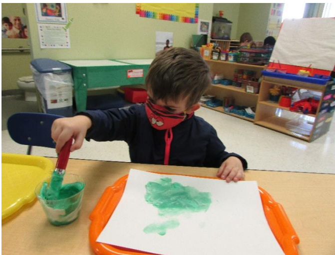
Milky Way (PS 3) Artist at Work