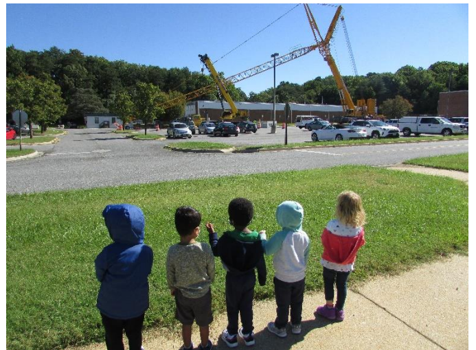
Milky Way (PS3) Making Observations