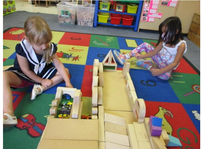
Constellations (PreK) Young Engineers