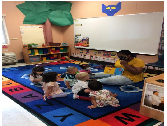
Comets (PS2) Story Time