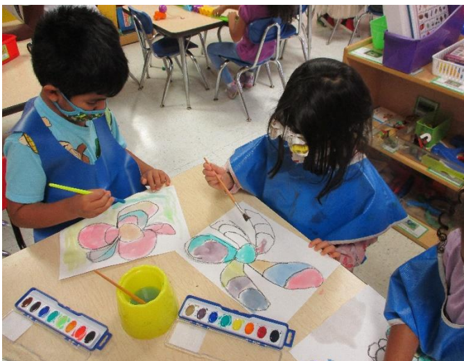
Constellations (PreK) Appreciation for the Arts