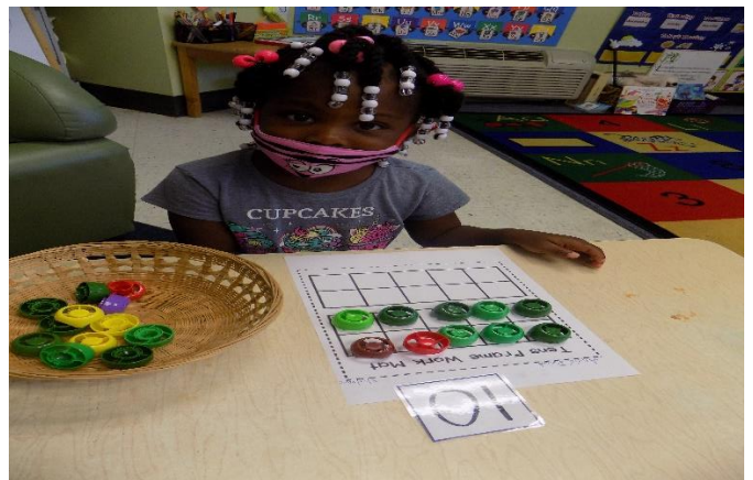
Shooting Stars (PS4) Tens Frame Math