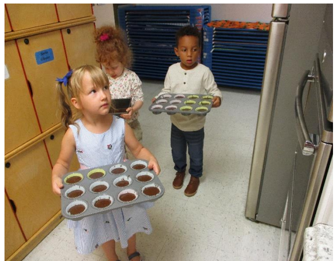
Constellations (PreK) Cooking Projects