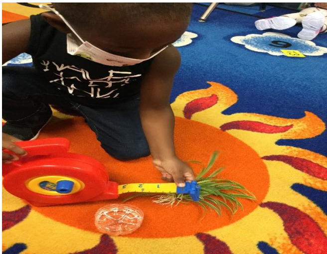
Little Dippers (PS3) Learning about Measurement