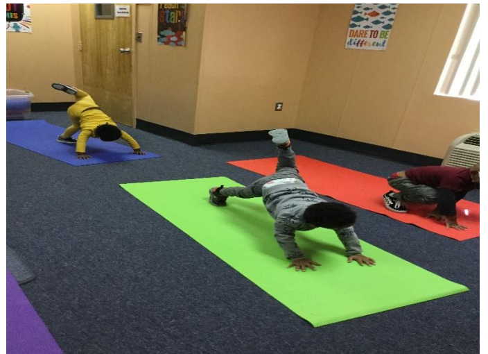
Little Dippers (PS3) Yoga