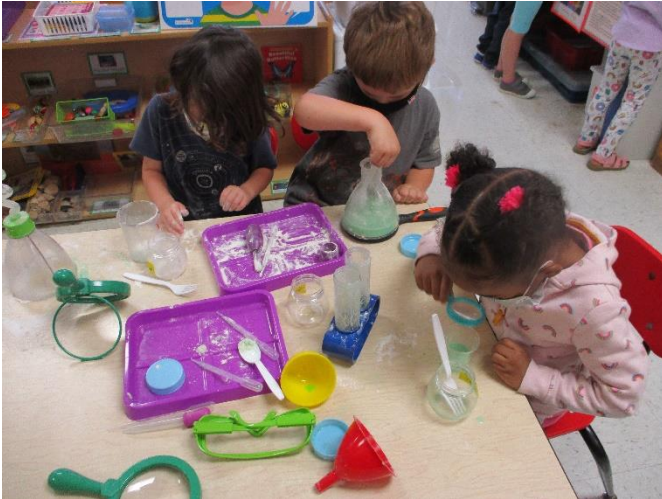
Constellations (PreK) Science Experiment Obbleck