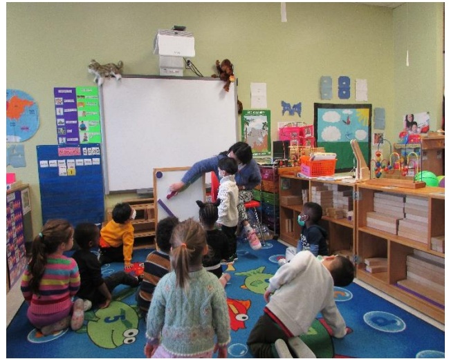
Everything's Magnetic Milky Ways: PS3