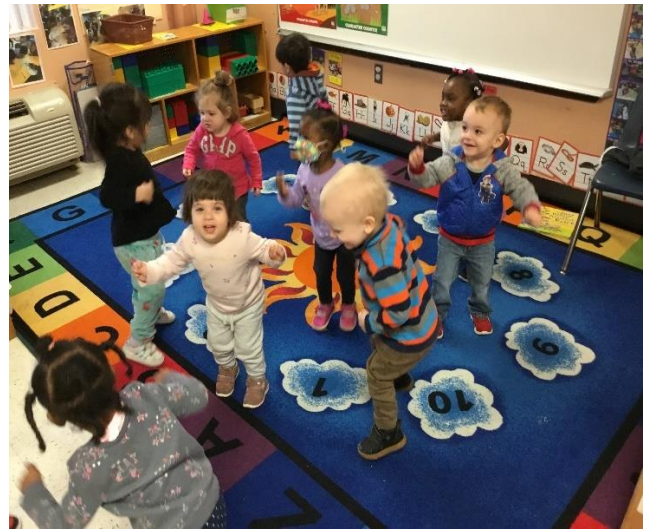
Music & Movement Comets: PS2