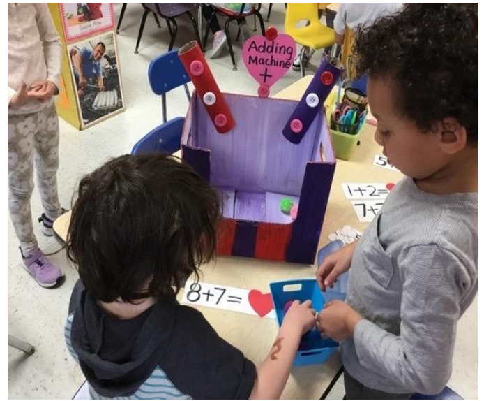
Simple Addition Constellations: PreK