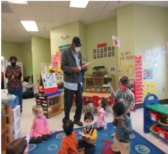
Mail Delivery- Parent Love Notes Milky Ways: PS3