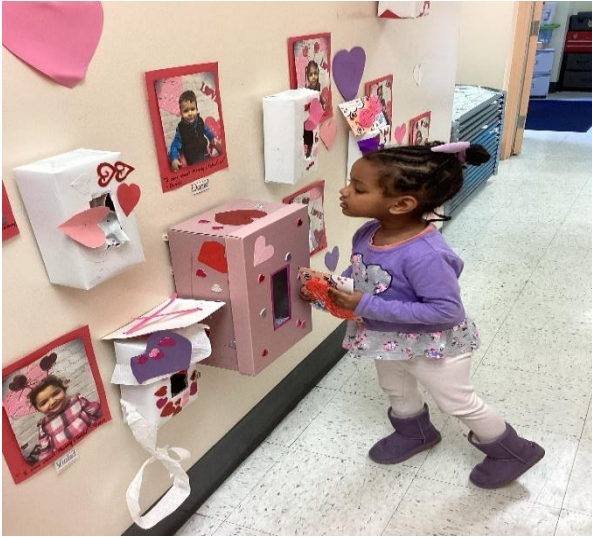
Mail Delivery – Friendship Notes Little Dippers: PS2