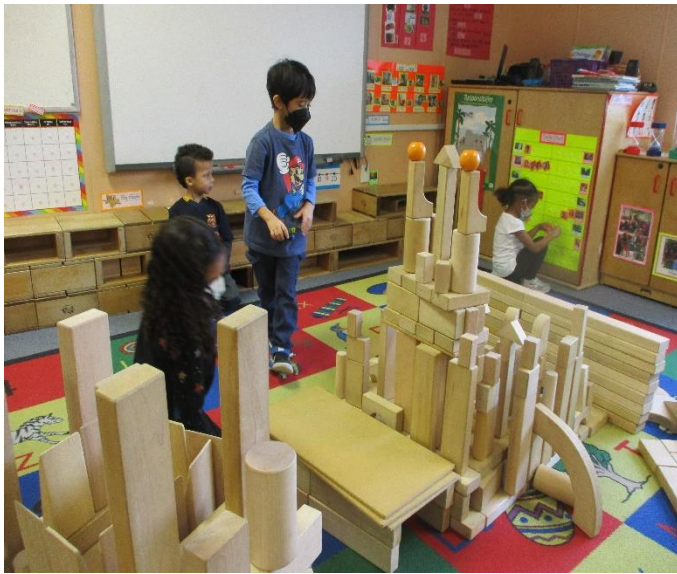
Exploring Static Engineering Constellations: Pre-K