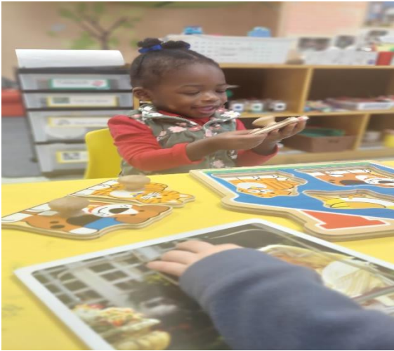
Exploring Puzzles with Friends Comets PS 2