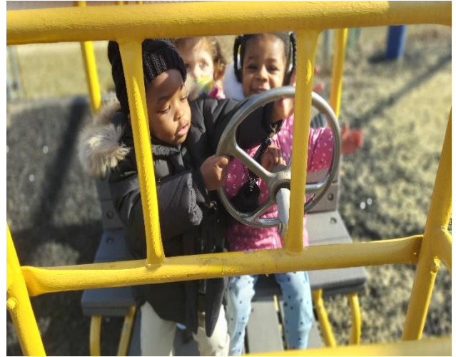
Outdoor Play with Friends Comets PS 2