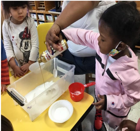
Science W/ Comets PS 2