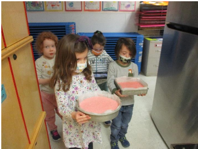
Cooking Projects Constellations: Pre-K