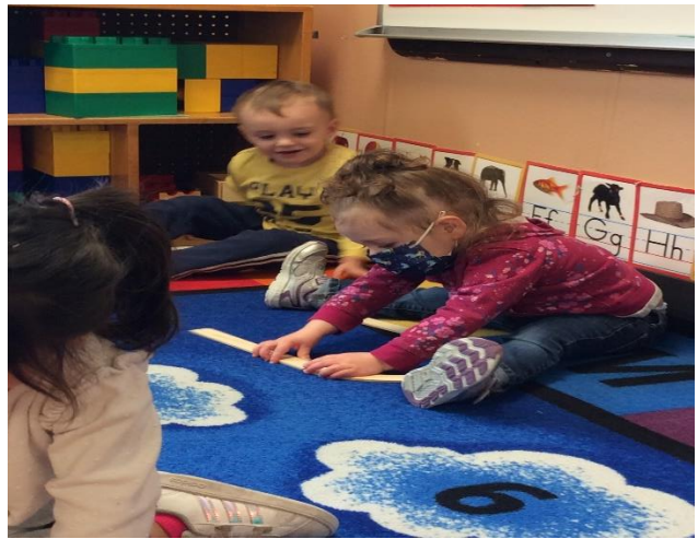
PS2: Comets Handwriting w/o Tears