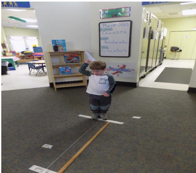
PS4: Shooting Stars Paper Airplane Contest