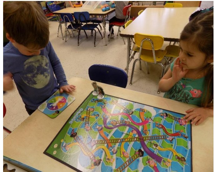
PS4: Shooting Stars Board Games w/Friends