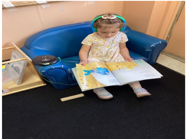
PS2: Little Dippers Independent Story Time