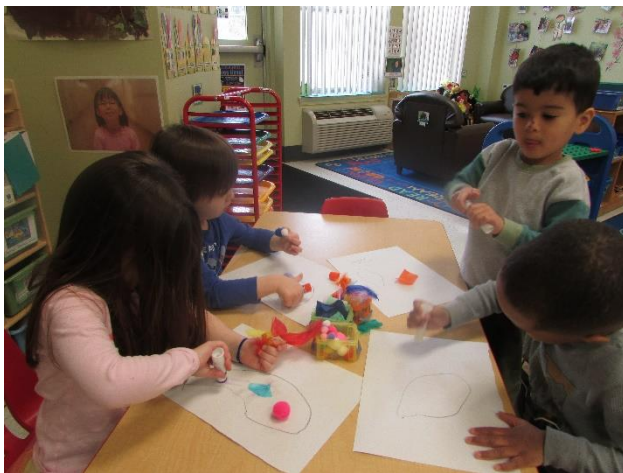
PS3: Milky Way Collage Art