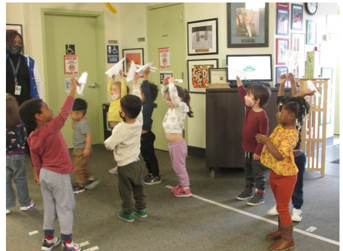
PS3: Milky Way Paper Airplane Contest