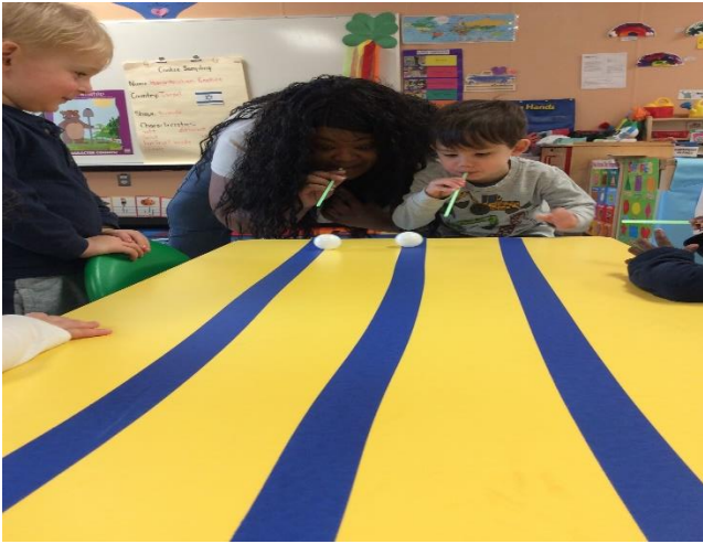
PS2: Comets Preschool Physics