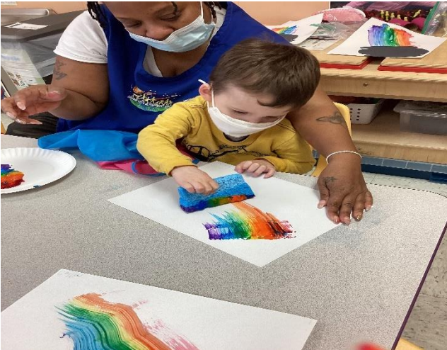
PS2: Little Dippers Textured Rainbow Painting